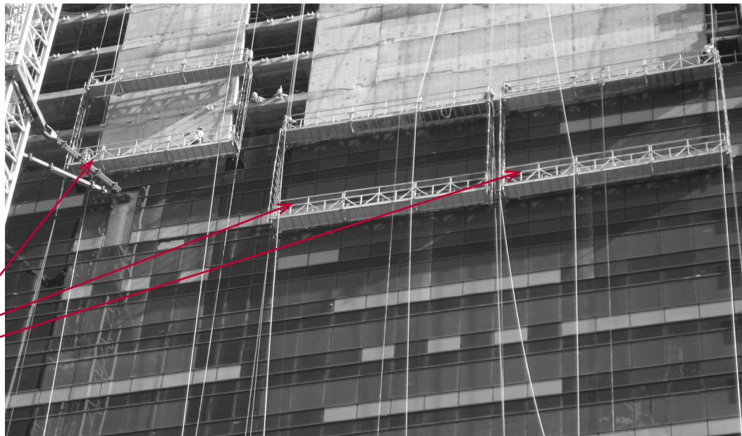
3 double-tier platforms installing curtain wall system

Check out the products featured in this case study: