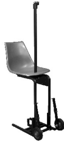
BOSUN CHAIR:ASTRO/MC10/PC1 9-73R BOSUN CHAIR:SC1000 710272-1R