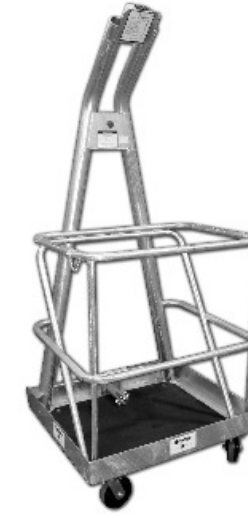
STEEL WORK CAGE:SPIDER 701086-1R