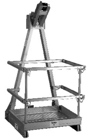
WORK CAGE: SPIDER: W/O CASTERS 700903-1R