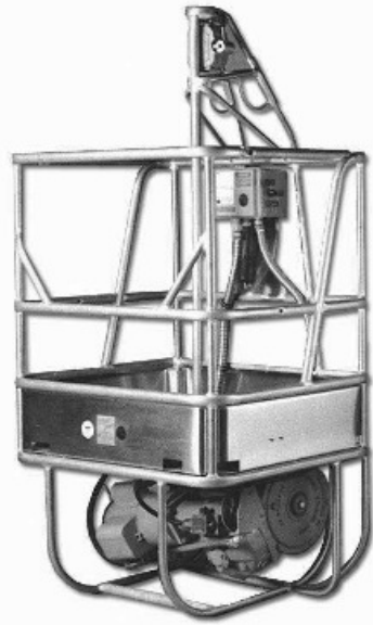
SPIDER:ELEC:220V:500' DRUM ST-180-XR