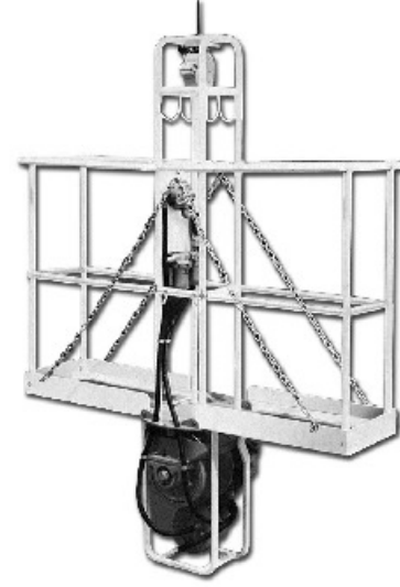
SPIDER: MINI ST-26-XR