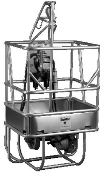
SPIDER:AIR:500' DRUM ST-17-XR