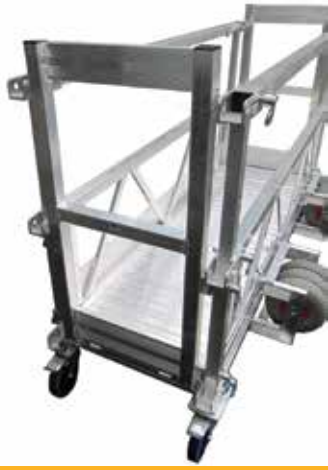
End guardrail can be used in combination with Walk-Thru Stirrups