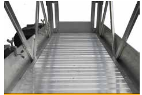
Durable, light weight aluminum deck