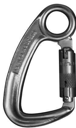
Steel Twist Lock Hook