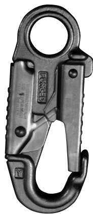
5/8 in. (16 mm) Double Lock Hook