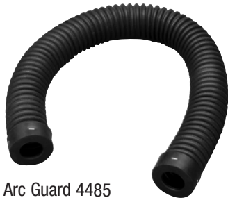
Top Arc Guard 4485